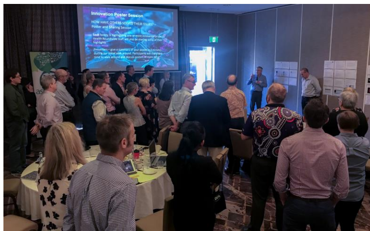
We hope you can join this growing group and share your wisdom as well as gaining new knowledge from your peers.